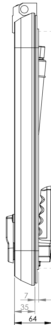
Dimension Including Mosquito Screen